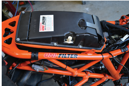
Soft Foam Air Box seal Fitted

Push the air box screws through the air box lid and the dust seal. Attach the rear engine breather hose and screw the lid evenly to the base. Do not over tighten.