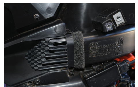
Snorkel Pre-Cleaner secured by Factory Plastic Grid