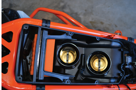
Main Filter Fitted

Place main filter in position. Make sure the filter is seated properly at the base of the air box and close. Secure the retaining clip. This is firm to close. (We recommend using a small amount of grease on the sealing edge of the filter combat any warpage in the plastic air box)