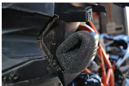
Snorkel Pre-Cleaner Front