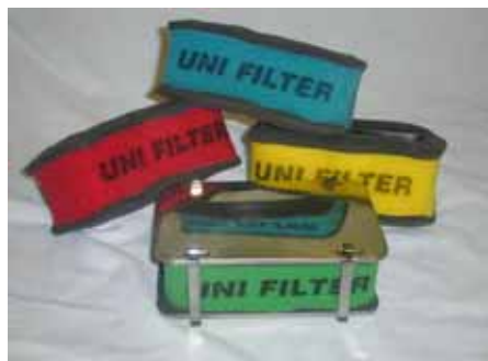
Series 2 & 3 – Rectangular Element

Unifilter Replacement elements for Warneford sports filters.