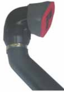
Ram Head Cover