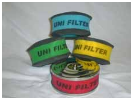
Series 1, 7 & 8 – Circular Element