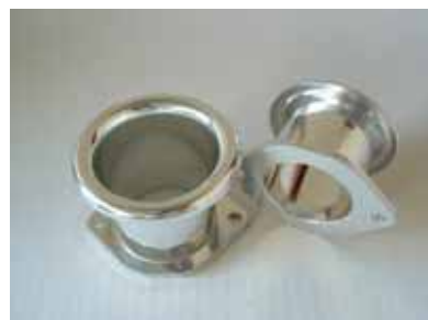
Ramtube 40, 45