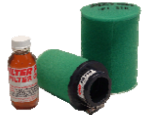
Straight or Angled Pod Kits