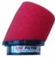
30° Angled Attachment