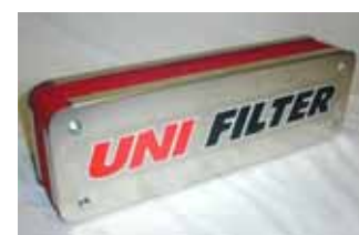
Throttle body assembly with optional aluminium top plate