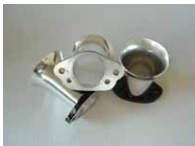
RTSU 125, 150, 175