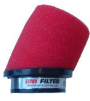
30° Angled Attachment