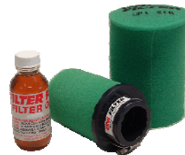
Straight or Angled Pod Kits