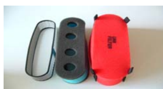
Kit includes cage, inner foam and two outer foams