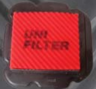
Road Bike Filters