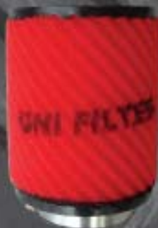
Custom Induction Pods