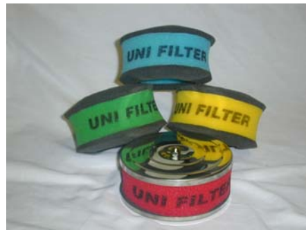
Series 1, 7 & 8 – Circular Element