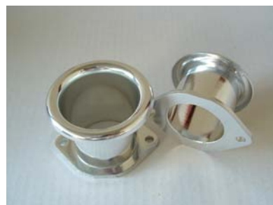
Ramtube 40, 45