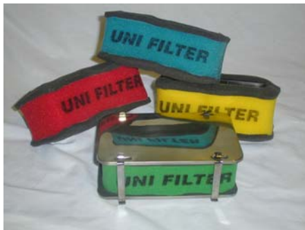
Series 2 & 3 – Rectangular Element

Unifilter Replacement elements for Warneford sports filters.