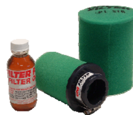
Straight or Angled Pod Kits