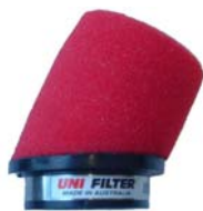
30° Angled Attachment