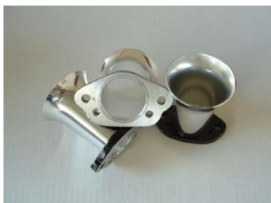
RTSU 125, 150, 175