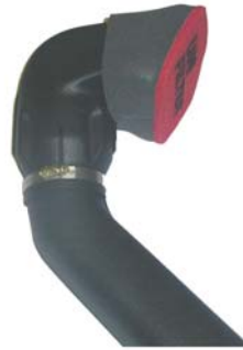
Ram Head Cover