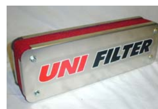
Throttle body assembly with optional aluminium top plate